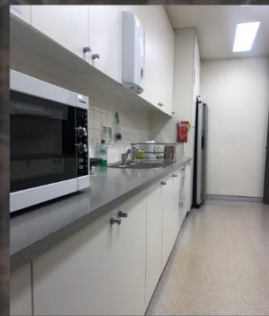
A full kitchen facility, with on-site catering also available (catering at your expense)