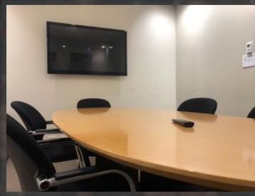
On-site WiFi, with the latest in Projectors, Digital Displays and Teleconferencing equipment