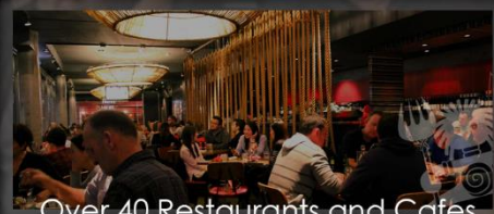
Over 40 Restaurants and Cafes throughout Olympic Park