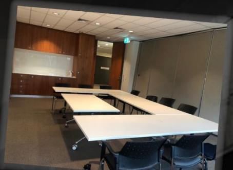
Capable of seating anywhere from 5 to 65 people for conferences or AGM's