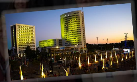
Over 15 hotels within walking distance

To take advantage of these facilities, contact Adam Brook on 0429333528 or adam@speedwayaustralia.net.au