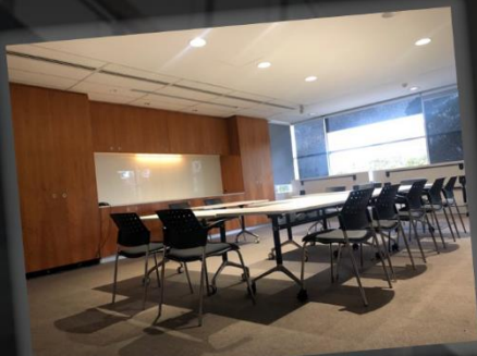
Modern Facilities with 6 rooms available in various seating and table configurations