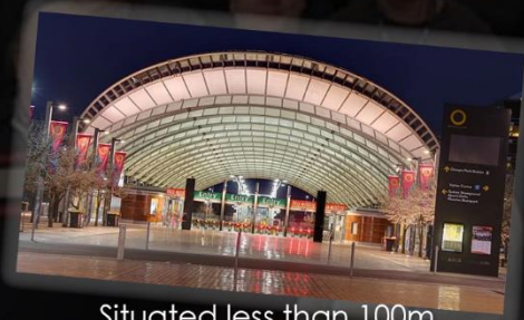
Situated less than 100m from Public Parking & Public Transport