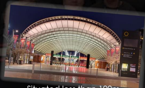
Situated less than 100m from Public Parking & Public Transport

A full kitchen facility, with on-site catering also available (catering at your expense)