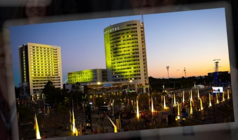
Over 15 hotels within walking distance

To take advantage of these facilities, contact Adam Brook on 0429333528 or adam@speedwayaustralia.net.au