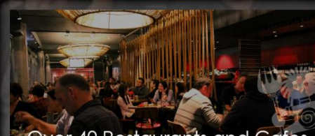
Over 40 Restaurants and Cafes throughout Olympic Park