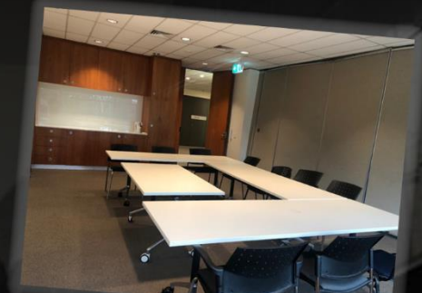
Capable of seating anywhere from 5 to 65 people for conferences or AGM's

On-site WiFi, with the latest in Projectors, Digital Displays and Teleconferencing equipment