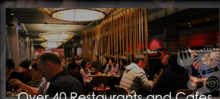
Over 40 Restaurants and Cafes throughout Olympic Park