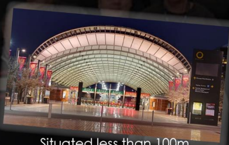
Situated less than 100m from Public Parking & Public Transport