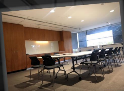
Modern Facilities with 6 rooms available in various seating and table configurations