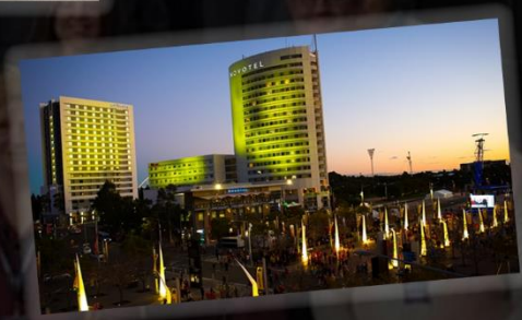
Over 15 hotels within walking distance

To take advantage of these facilities, contact Adam Brook on 0429333528 or adam@speedwayaustralia.net.au